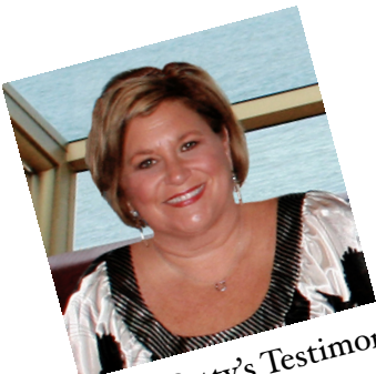
Sandi Patty's Testimony

Non-Profit Org. U.S. Postage Paid Richardson, TX 1052